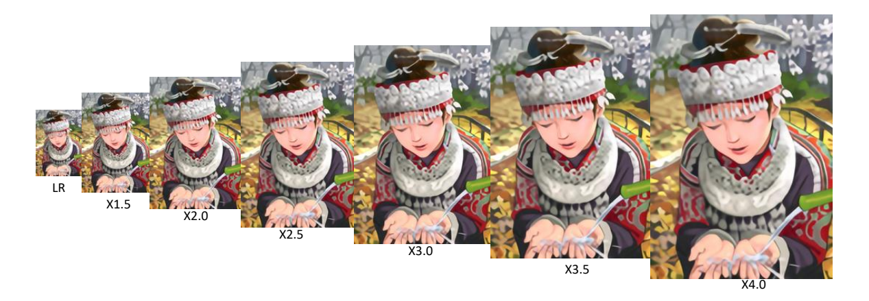
Figure 3. The visual comparison of an single image upsampling with different scale factors by our Meta-RDN.