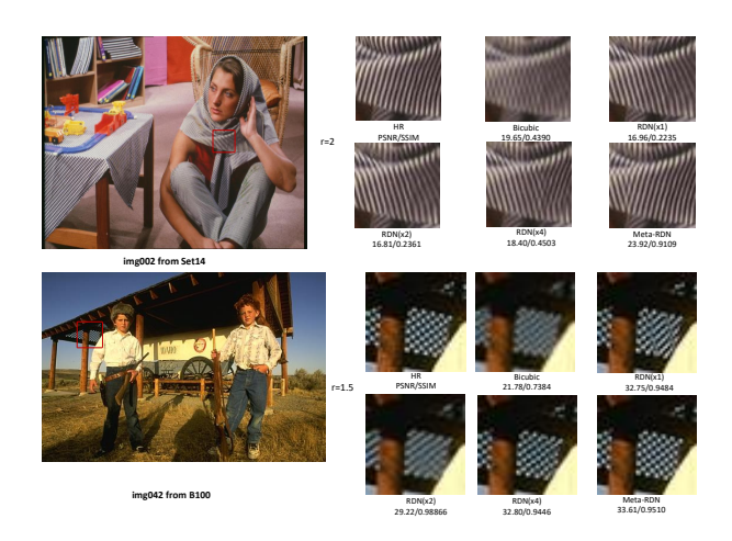
Figure 4. The visual comparison with four baselines. Our Meta-RDN has better performance.

We propose a novel upscale module named Meta-Upscale to solve the super-resolution of arbitrary scale factor with a single model. The proposed Meta-Upscale Module could dynamically predict the weights of the filters. For each scale factor, the proposed Meta-Upscale Module generates a group of weights for the upscale module. By doing convolution operation between the feature maps and the filters, we generate the HR image of arbitrary size. Thanks to the weight prediction, we can train a single model for super-resolution of arbitrary scale factor. Especially, our Meta-SR can continuously zoom in the same image with multiple scale factors.